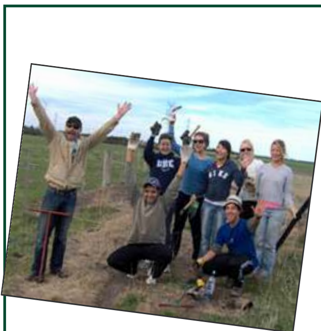
ANZ planting team at Moorabool September 2006

We hear the team has become very 'clucky' and do not talk about